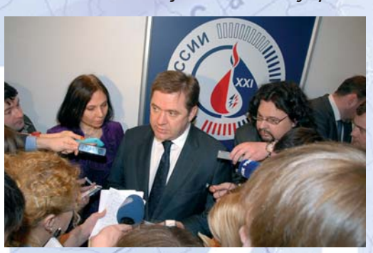
Participation in the Plenary Discussion of Sergey Shmatko, Russian Minister of Energy, aroused great interest among journalists